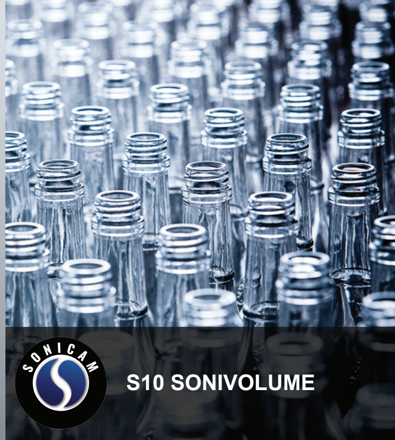
S10 SONI VOLUME

Sonicam S10 measures bottle volume at the HOT end and at the COLD end.