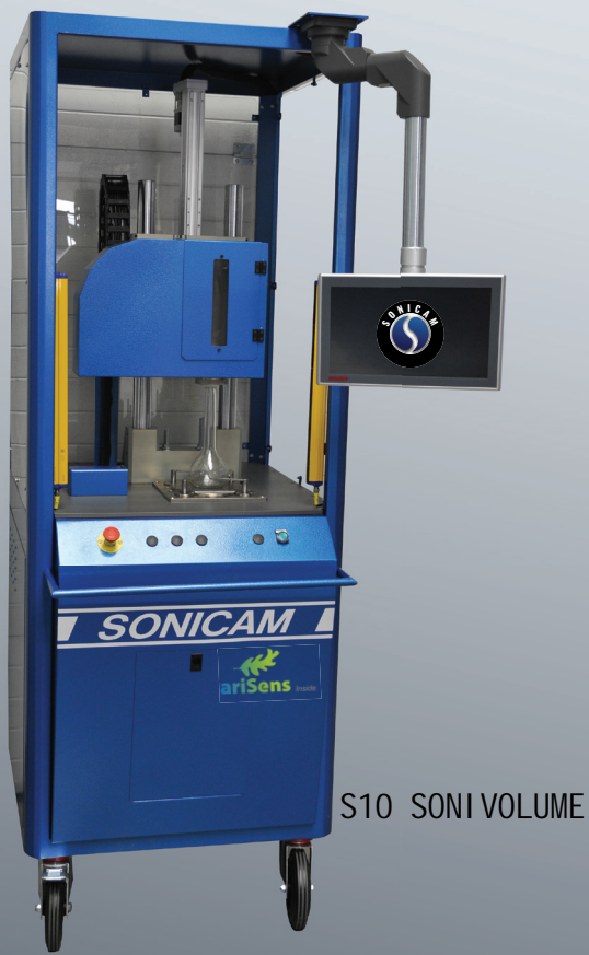
S10 SONI VOLUME